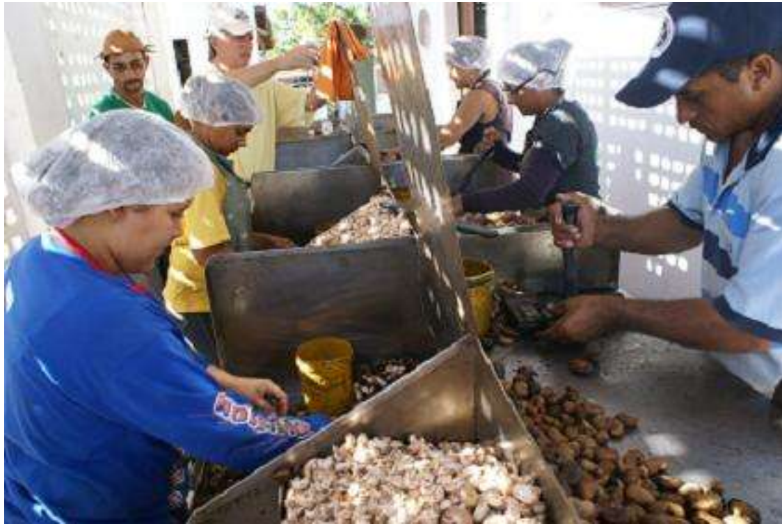
Removing hulls from cashew nuts