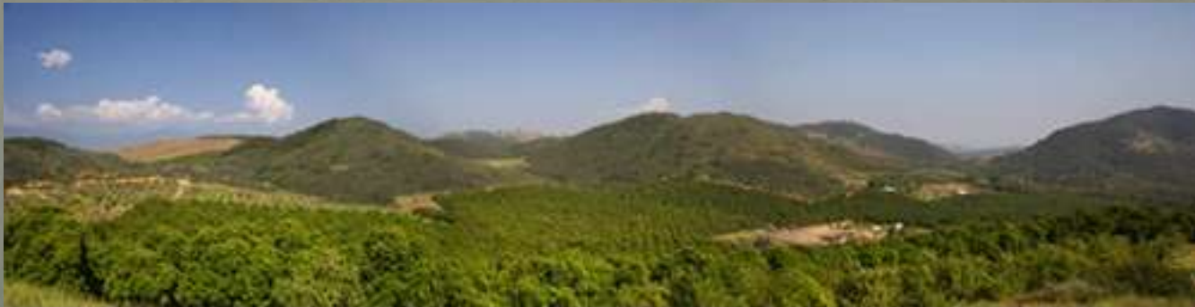
Panoramic view of Stehly Farms Organics