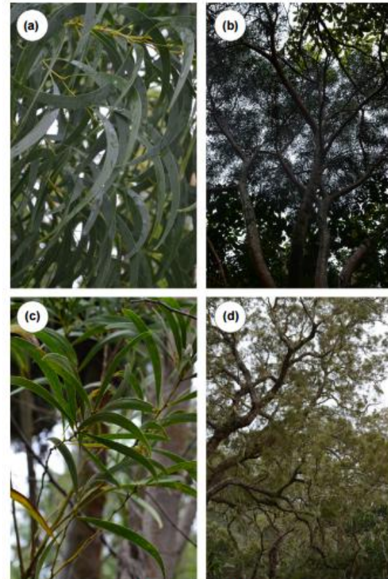
Fig. 1 Acacia koa from the Hawaiian Islands (a, b) and A. heterophylla from Réunion Island (c, d), showing the strong morphological similarities between these two island endemics.